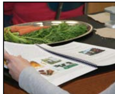
Elementary teachers needed to review MAC Lessons during February and April Vacations.

During the year 2015, MAC will add twenty-four additional web-based lessons representing the diversity of agriculture across the state – three new lessons for each grade from first through fourth and nine lessons for grade five and six. Each lessons will provide agricultural background content, classroom activ-