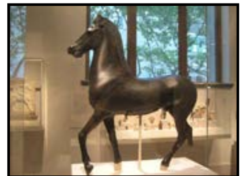
Statue of a Horse, 1 st Century B.C.