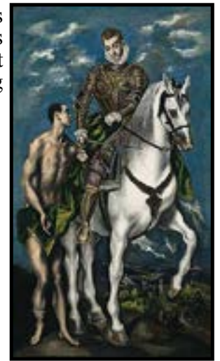
El Greco - Saint Martin and the Beggar (1600)