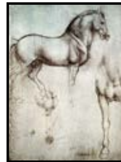
Leonardo Davinci, Study of a Horse (1490)

Images of horses have appeared in art since humans have been writing and painting on cave walls. The first images we have are from 16,000 years ago. They were found in the Lascaux Caves in southwestern France. Below are other examples of famous works of art containing horses.